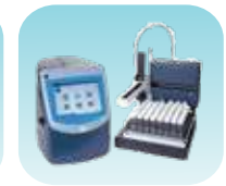
Total Organic Carbon 3800