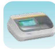
Micro Plate Reader/Washer