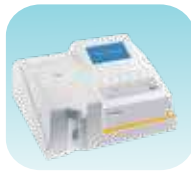
Semi Auto Bio Chemistry Analyzer