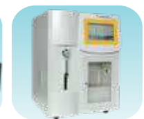
Liquid Partical Counter