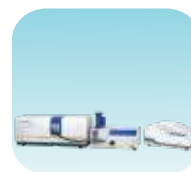
Laser Particle Size Analyzer